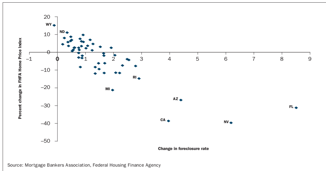
Figure 3 Change in foreclosure rate and FHFA House Price Index by state, 2006Q1–2008Q4

lot size, the square footage and age of the home, and the number of bedrooms and bathrooms) and neighborhood characteristics. Notably, studies vary significantly in their coverage of property and neighborhood features—with the latter often simply proxied for using location indicators like ZIP code. Nevertheless, if one thought these property and neighborhood characteristics were well controlled for, any statistically and economically significant foreclosure discount could then presumably be ascribed to differences in property quality or liquidity. Note that, to date, there has been only limited investigation seeking to identify these two effects separately.